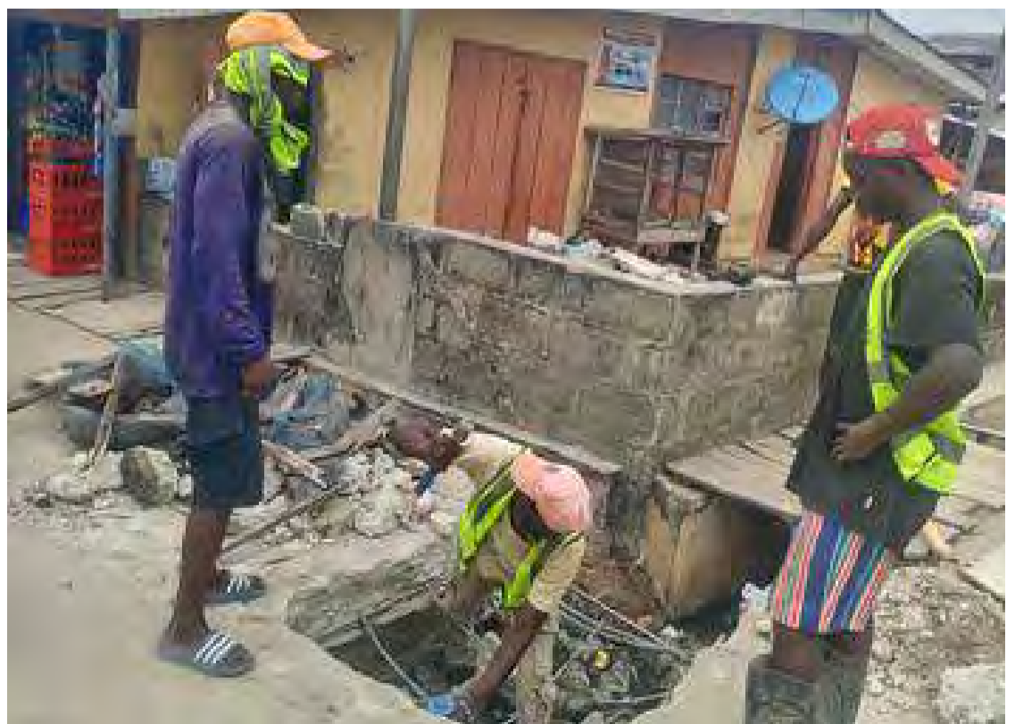
The ongoing reconstruction of Bethel Street

They believe the upgraded street will not only enhance property values but also stimulate economic activity in the area.