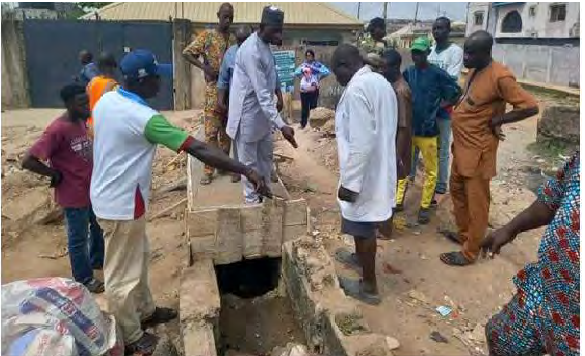
Agbado/Oke-Odo LCDA Chairman Inspects Ongoing Road Projects to Improve Connectivity and Ease Traffic

During the inspection, residents warmly applauded the dedicated Chairman for his consistent efforts in delivering the dividends of democracy to all corners of the community.